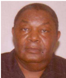
Victor Chukuma Johnson Deputy Speaker of Parliament

She contested the Local Council Elections in July 2008 and was elected Councillor for Constituency 108 Ward 382 under the All Peoples Congress.