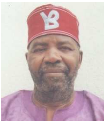
Yisa East Braimoh Senator

Hon. Oladimeji S. Bankole is a graduate of Economics, son of former Second Republic National Party of Nigeria Chieftain. He was elected on the ticket of PDP in 2003 into the House of Representatives representing Abeokuta South Federal Constituency of Ogun State. In 2007, he won re-election into the House of Representatives representing the same constituency, and was elected speaker in November, 2007.