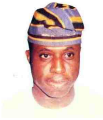
Oladimeji S. Bankole Speaker, House of Representatives

Hon. Oladimeji S. Bankole is a graduate of Economics, son of former Second Republic National Party of Nigeria Chieftain. He was elected on the ticket of PDP in 2003 into the House of Representatives representing Abeokuta South Federal Constituency of Ogun State. In 2007, he won re-election into the House of Representatives representing the same constituency, and was elected speaker in November, 2007.